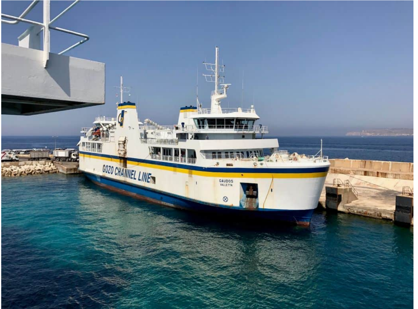
The Three Cities