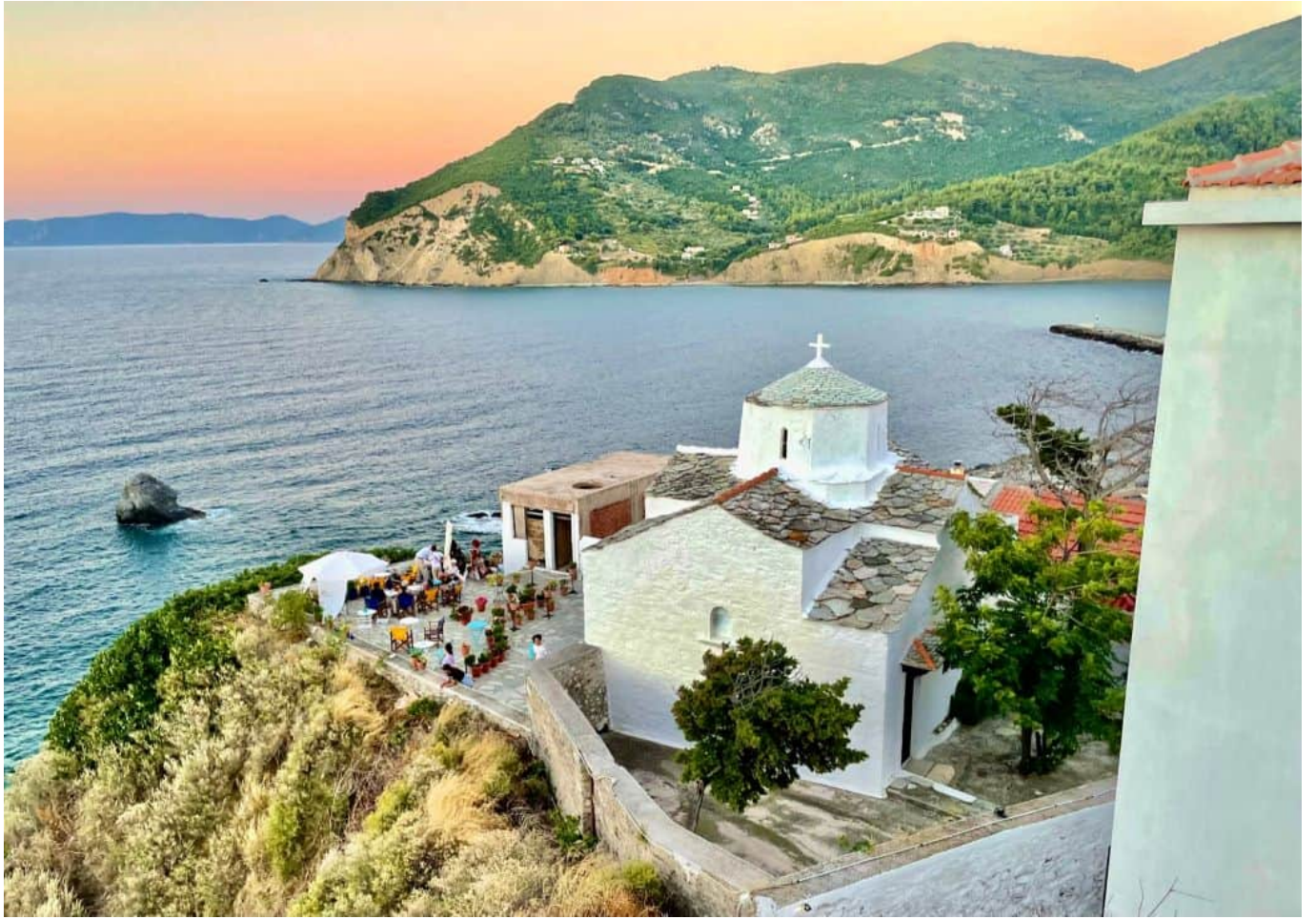
Skopelos Town, Skopelos