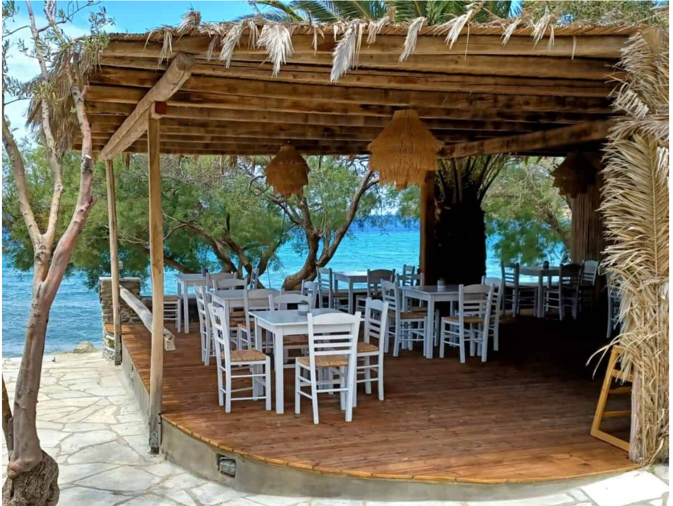
Kochyli Taverna, Agios Romanos Beach