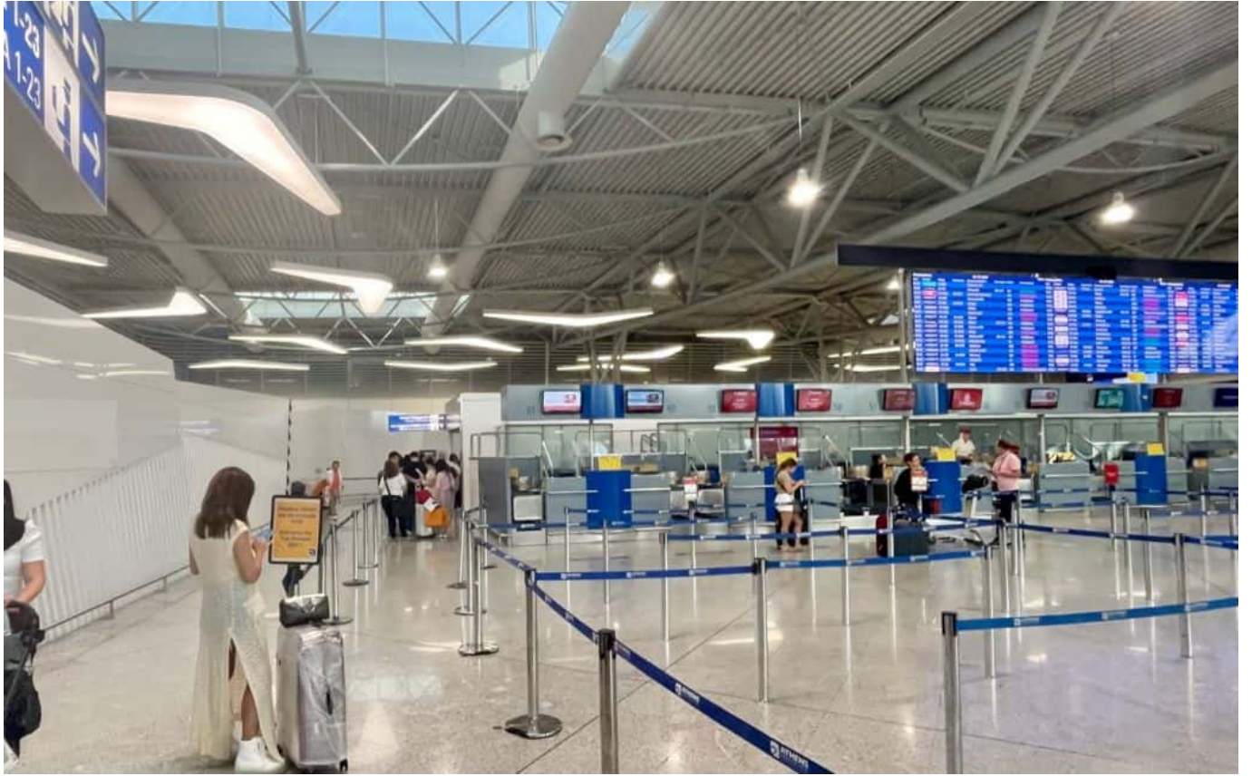
VAT Desk queue curbside ( on the left with all the people)