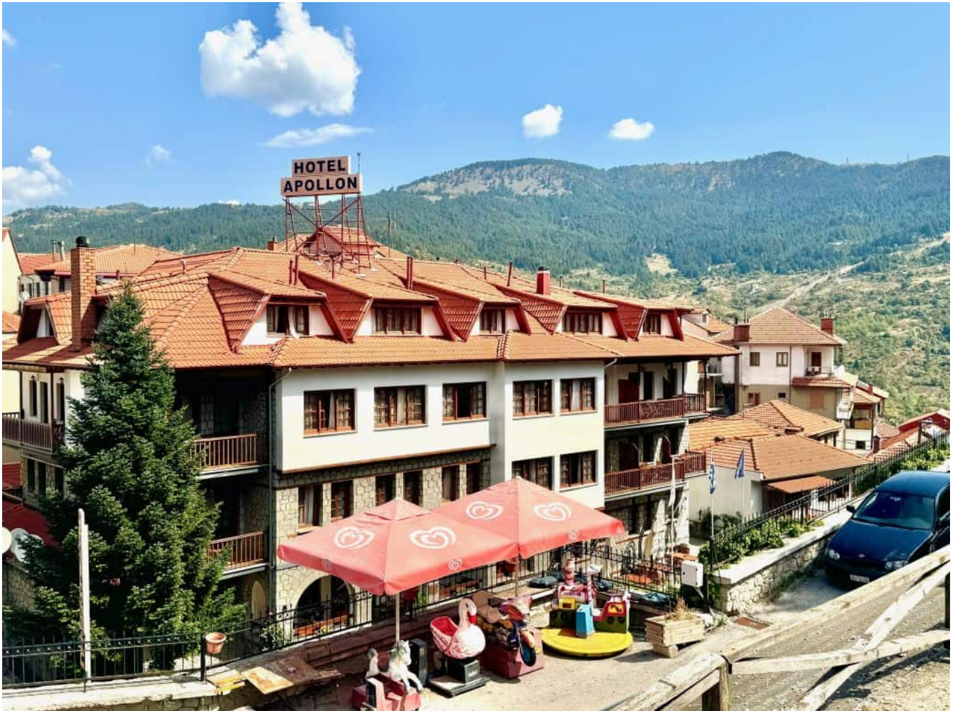
Hotel Apollon Metsovo